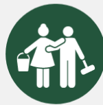
Clean Up Crew