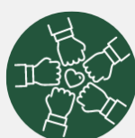
Set up Crew